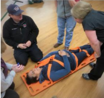
Expert instruction is available to all volunteers